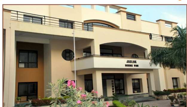
SHGC: Jaslok Science Wing