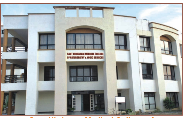
Sant Hirdaram Medical College of Naturopathy & Yogic Sciences